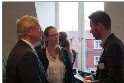
ERA-Net Smart Grids Plus is a partnership with European funding programs.